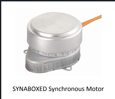
SYNABOXED Synchronous Motor