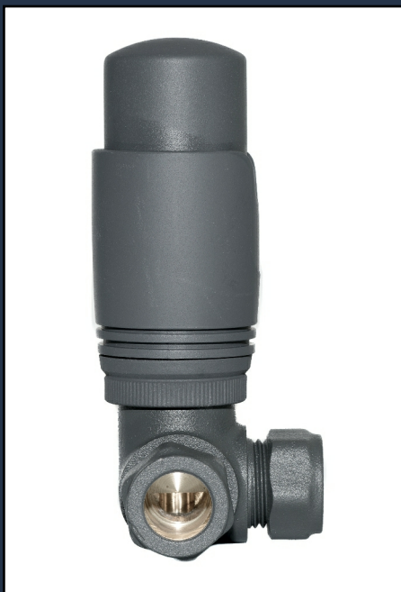
CORNER TRV ANTHRACITE