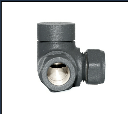
CORNER LOCKSHIELD ANTHRACITE